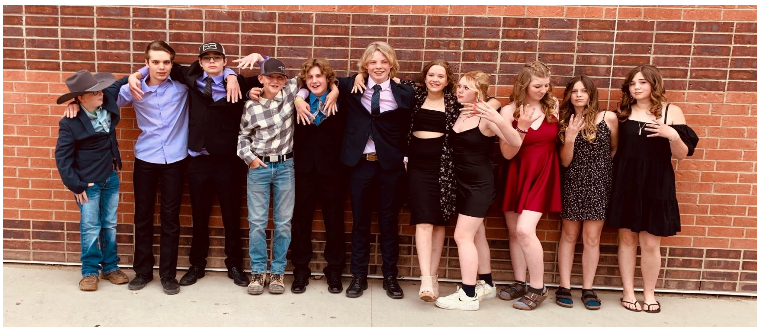
(2022 – some of grade 8 class that attended first Prom in 3 years)