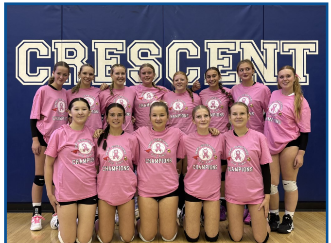
Congratulations to our Senior Girls Queens Volleyball team on winning gold at the McCoy Tournament! Good work girls!!