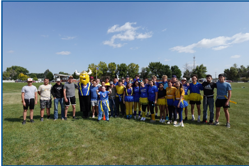
VHS Annual Blue Cup Game against the staff/parents. The Grads came up victorious and earned themselves a pizza party!