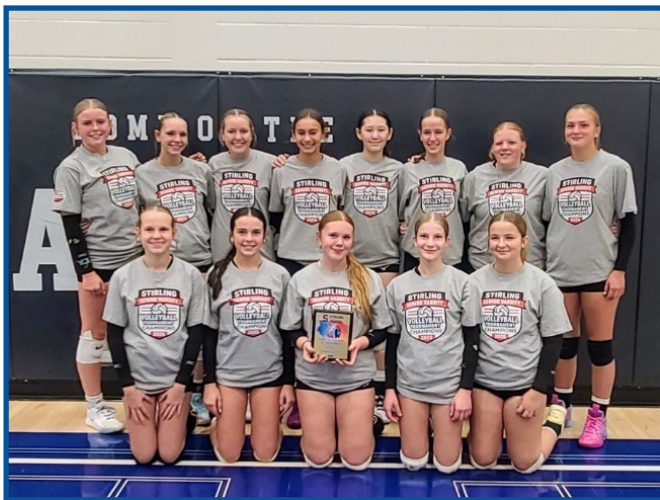
Congratulations to our Senior Girls Queens Volleyball team on winning gold at the Stirling Tournament! Way to go girls!!